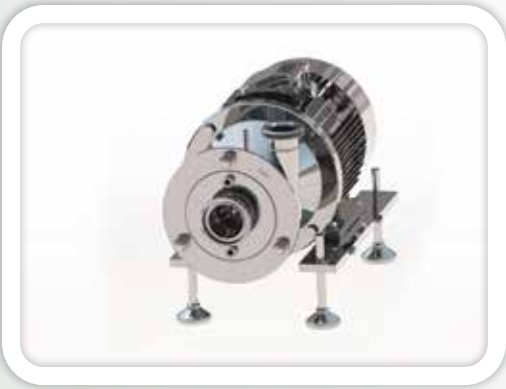
LME-V532 with heating jacketed cover