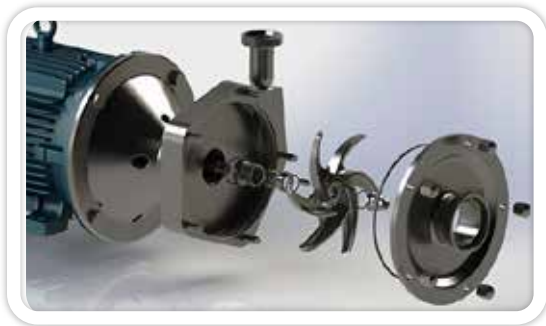
Exploded view LME-Series