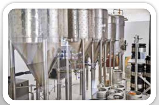
Brewery Fermenting Tanks