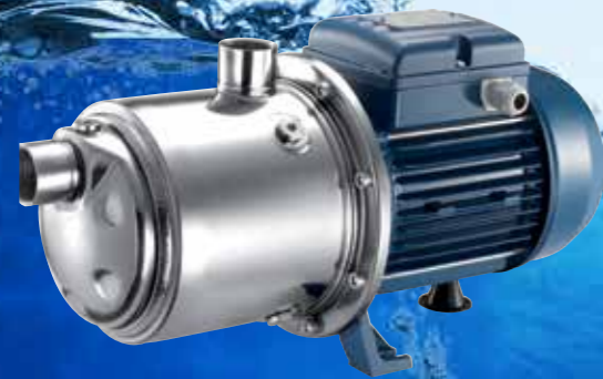
CENTRIFUGAL MULTISTAGE PUMPS