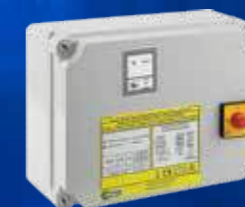
ACCESSORIES AND MORE