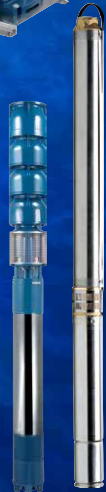
SUBMERSED PUMPS & MOTORS