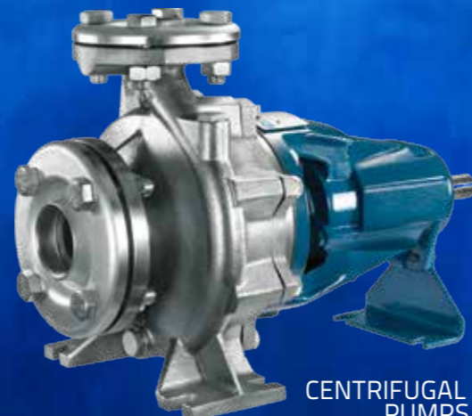
CENTRIFUGAL EN733 PUMPS