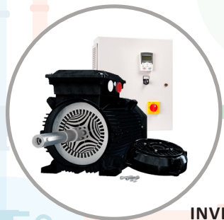
INVENTA TEK UE CONTROL PANEL