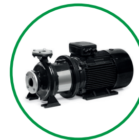
CNG 2 & 4 POLES