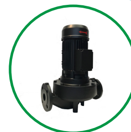
ILP 2 POLES