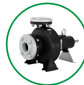
BSN 2 & 4 POLES